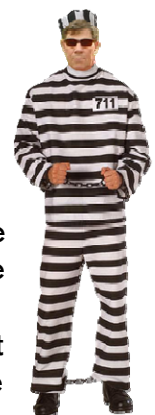
This is NOT an activity uniform!